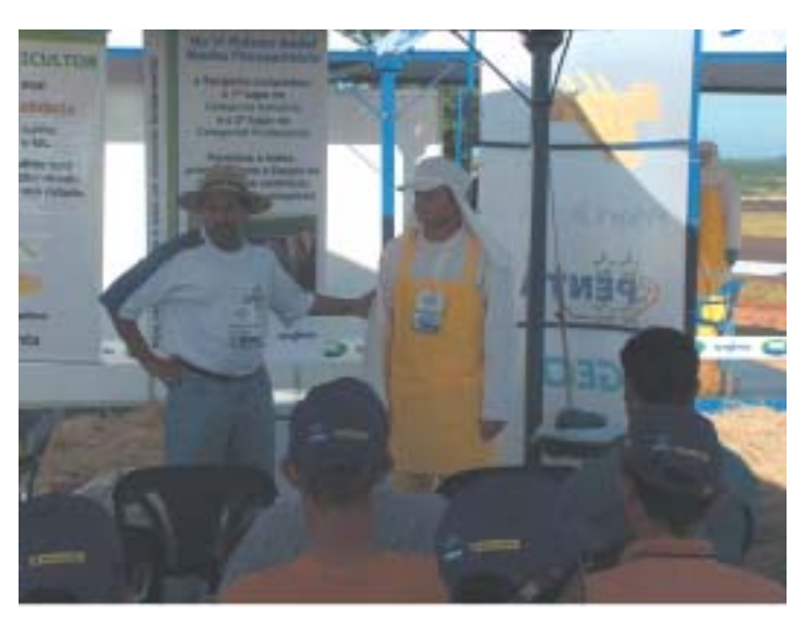
Safe use training in Paraná, Brazil, January 2004. Locally manufactured, water resistant, light cotton PPE with an apron for mixing. Over 500,000 sets of these have been distributed in Brazil and they are popular with users.

defines product stewardship as "the responsible and ethical management of pesticide product from its discovery through to its ultimate use and beyond". Syngenta believes that good product stewardship is a business imperative. Our vision is that Syngenta be recognised by stakeholders to be foremost in responsible and ethical product management.