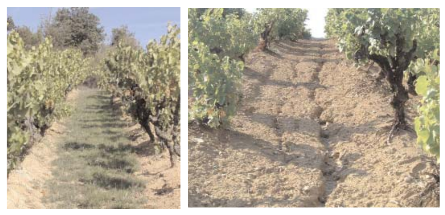
Paraquat is used in European vines to control 'suckers' and to manage grass cover crops, where it preserves grass roots. This helps maintain the soil stability and decreases erosion, improving water quality and safeguarding farm productivity for the future.

After application, free paraquat is rapidly degraded in the environment or becomes irreversibly deactivated by soil. This means that green plant material exposed to paraquat is desiccated and no residues are taken up from the soil into the treated or following crops. This residue profile is valuable to the food industry.