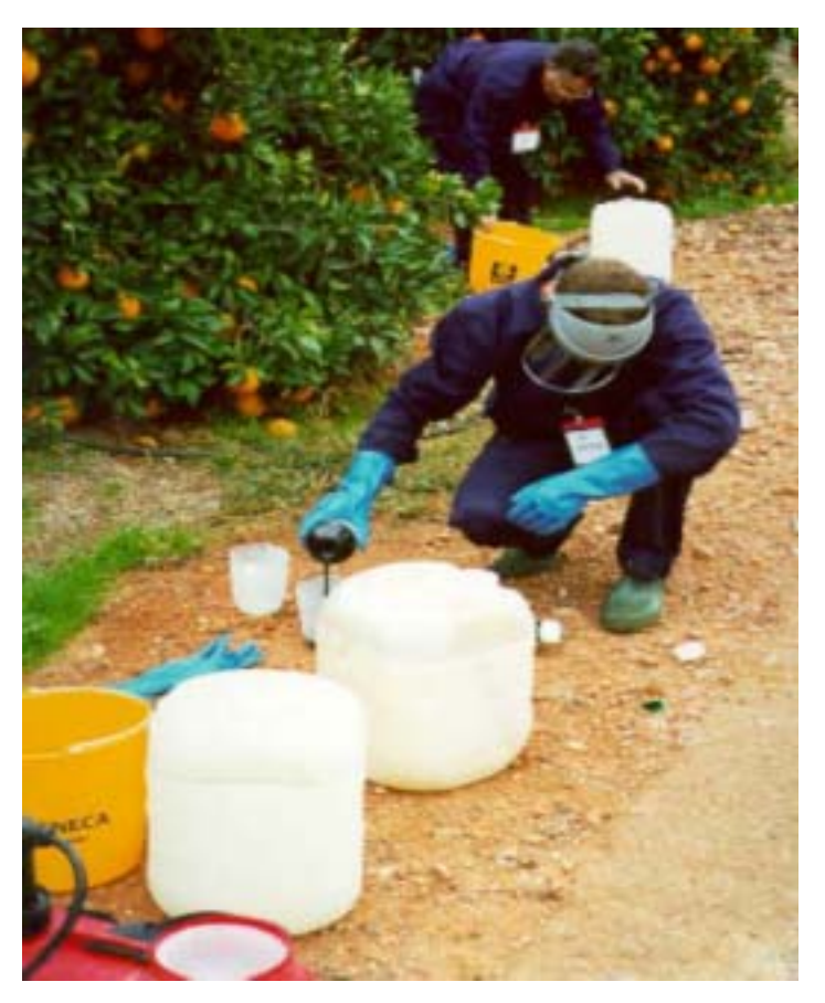
Training demonstration, citrus in Spain, measuring and loading Gramoxone.

Syngenta is committed to the FAO International Code of Conduct on the Distribution and Use of Pesticides. The FAO