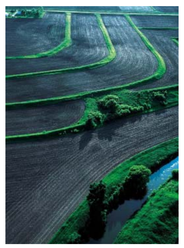
Terraces, conservation tillage and conservation buffers save soil and improve water quality on this farm in Woodbury County in northwest Iowa, USA.

combat these problems, methods of reduced tillage were proposed as early as the 1920s, but could not be implemented because of the problem of weed management. The introduction of paraquat in the 1960s finally enabled these theories to be implemented on a large scale as Minimal Tillage (Bromilow, loc. sit.) and led to the modern practice of Conservation Tillage, which increases soil fertility, while decreasing energy inputs and soil and nutrient loss in erosion (Fawcett & Caruana, 2001). Soils hold vast reserves of carbon, three times that held in trees and twice that in the atmosphere. Conventional tillage promotes the microbial mineralization of this carbon, decreasing the quality of the soils and increasing the carbon dioxide released into the atmosphere, thus contributing to global warming. Minimum tillage substantially decreases such losses. Paraquat was the key ingredient for the adoption of such systems and because of its unique properties, remains important today. Conservation tillage is now adopted on 60% of US corn acres and 85% of the soybean acreage, as well as in vegetables and many other crops. In Europe, the ability of paraquat to control green foliage but to leave soil-stabilizing roots intact has been incorporated into erosion-prevention programmes that have been shown to decrease the loss of soil by 66% (138 t/ha) in French vines (Llewelyn, 2004) and by 98% (48 t/ha) in Spanish olives (Gomez, 2004).