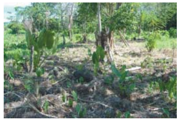
Precision use around a shallow rooted tropical crop, taro in Samoa. No other herbicide could be as effective as paraquat for this use as it is not taken up into the taro.

directly sprayed and banana 'mats', from which the fruiting stems grow and lack of drift due to low volatility, are of great value to both tropical smallholders and in commercial plantations such as palm oil, banana, rubber and pineapple. Paraquat's speed of action and absence of residues in crops make it the best practical choice of herbicides in the production of many tree and vine fruits in southern Europe and for the control of suckers that grow from some varieties of vine roots.